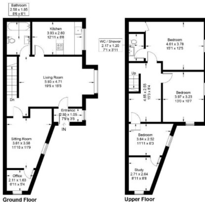
Illustration for identification purposes only, measurements are approximate, not to scale. Fourlabs.co © (1D1191119)

Approximate Gross Internal Area = 124.7 sq m / 1342 sq ft