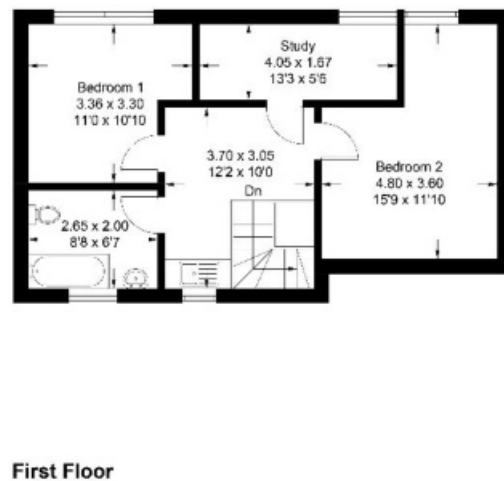
Illustration for identification purposes only, measurements are approximate, not to scale. Fourisbs.co © (ID1204570)