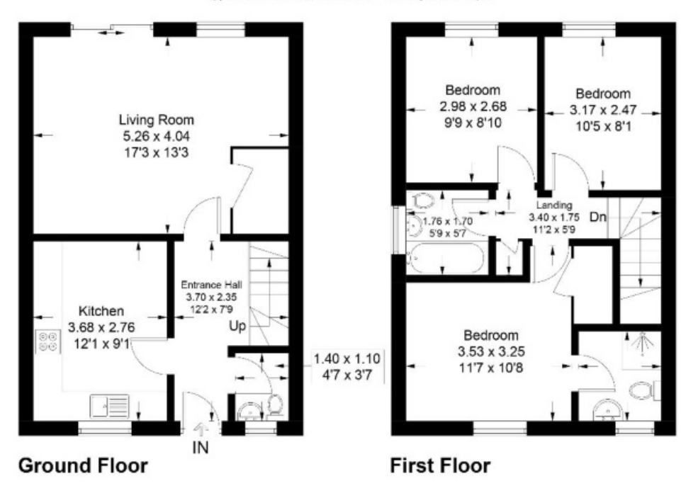
Illustration for identification purposes only, measurements are approximate, not to scale. floorplansUsketch.com © (ID1114239)

Approximate Gross Internal Area = 83.3 sq m / 897 sq ft