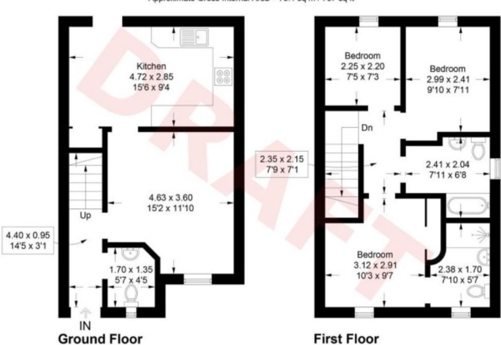
Illustration for identification purposes only, measurements are approximate, not to scale. floorplansUsketch.com ⊚ (ID1107355)

Approximate Gross Internal Area = 73.1 sq m / 787 sq ft