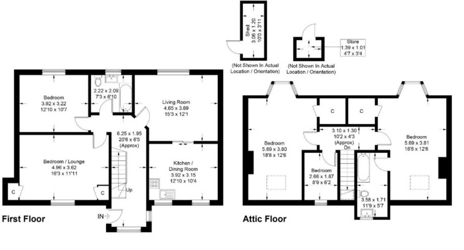
Illustration for identification purposes only, measurements are approximate, not to scale. Fourlabs.co @ (ID1135169)