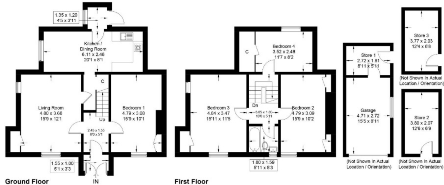
Illustration for identification purposes only, measurements are approximate, not to scale. (ID1127240)