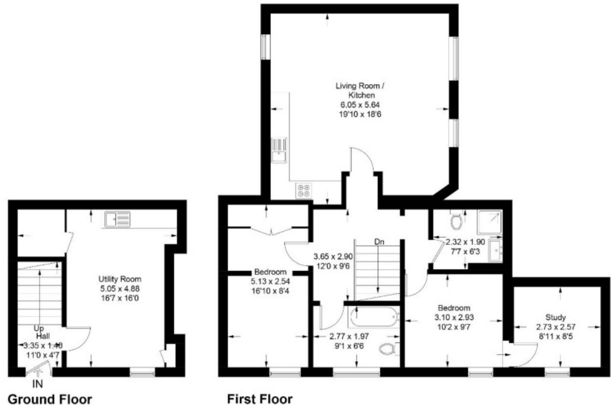
Illustration for identification purposes only, measurements are approximate, not to scale. floorplansUsketch.com © (ID1079564)