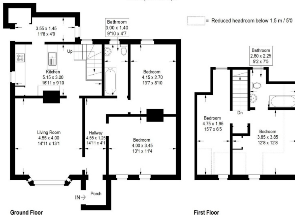
Illustration for identification purposes only, measurements are approximate, not to scale. FloorplansUsketch.com © 2024 (ID1082871)

Approximate Gross Internal Area 117.7 sq m / 1267 sq ft