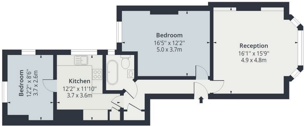
Second Floor Floor Area 775 Sq Ft - 72.0 Sq M