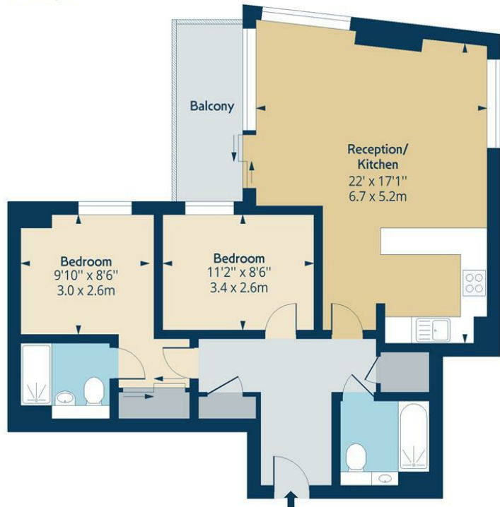
Ninth Floor Floor Area 808 Sq Ft - 75.00 Sq M