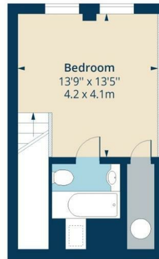
Mezzanine Floor Area 305 Sq Ft - 28.33 Sq M