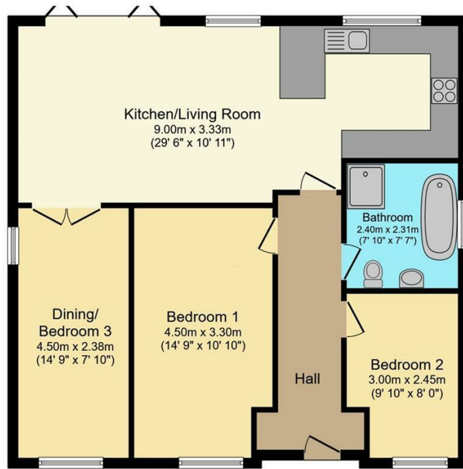
Floor Plan Floor area 74.8 m 2 (805 sq.ft.)