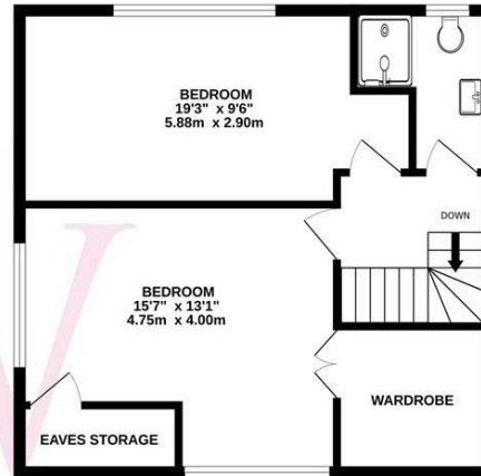
1ST FLOOR 520 sq.ft. (48.3 sq.m.) approx.