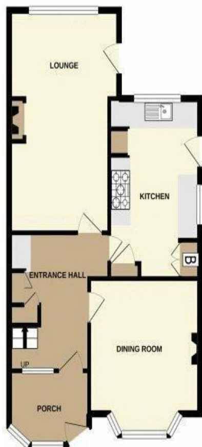
GROUND FLOOR 630 sq. ft. (58.5 sq.m.) approx.