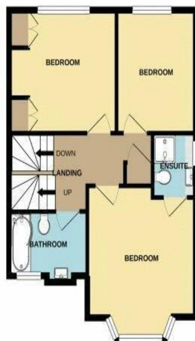
1ST FLOOR 503 sq. ft. (46.7 sq.m.) approx.