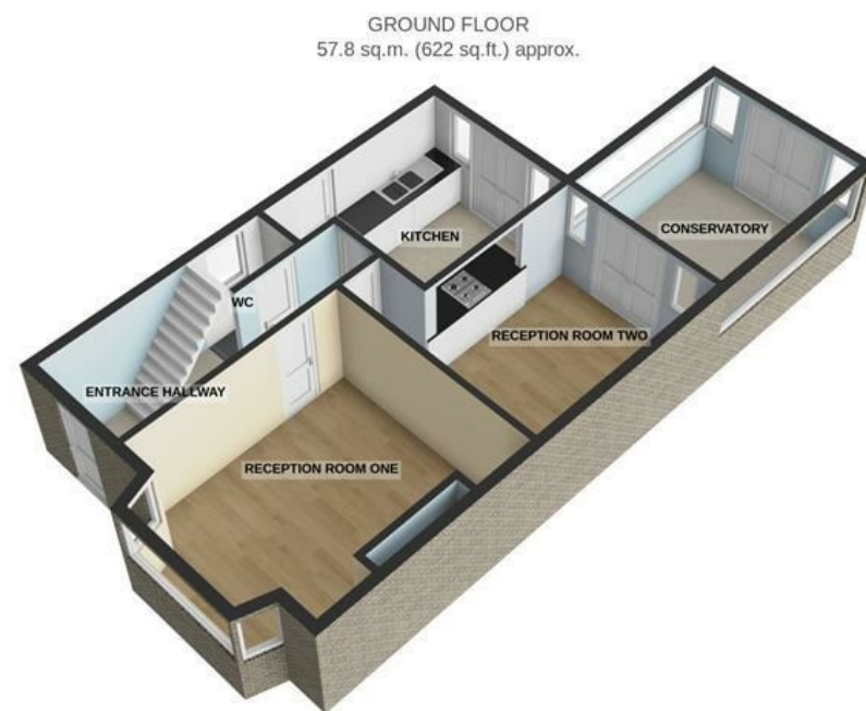
GROUND FLOOR 57.8 sq.m. (622 sq.ft.) approx.