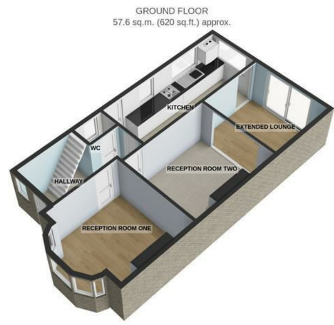
GROUND FLOOR 57.6 sq.m. (620 sq.ft.) approx.