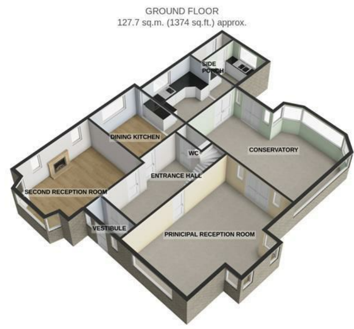
GROUND FLOOR 127.7 sq.m. (1374 sq.ft.) approx.