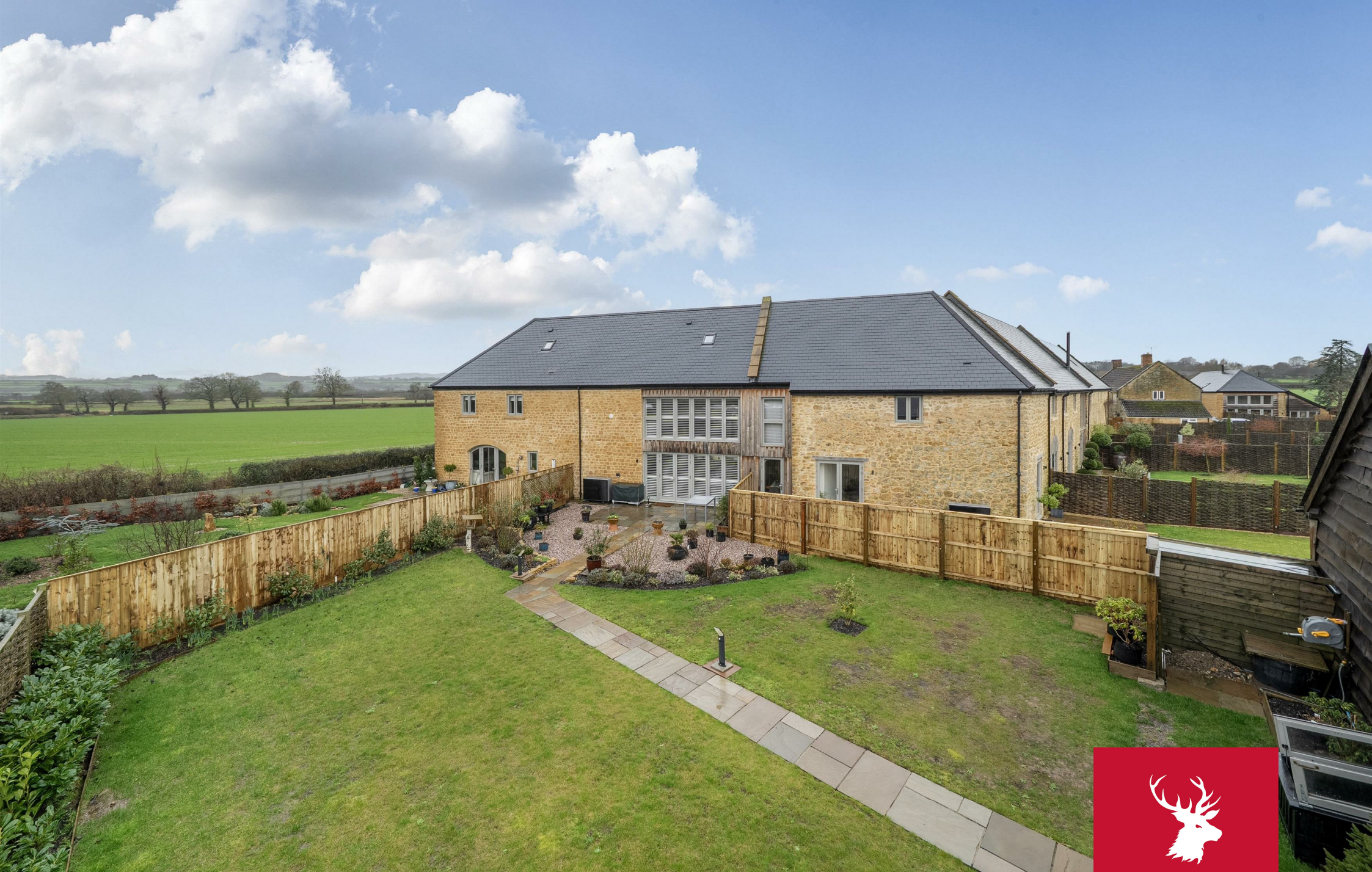
6 Yeabridge Court