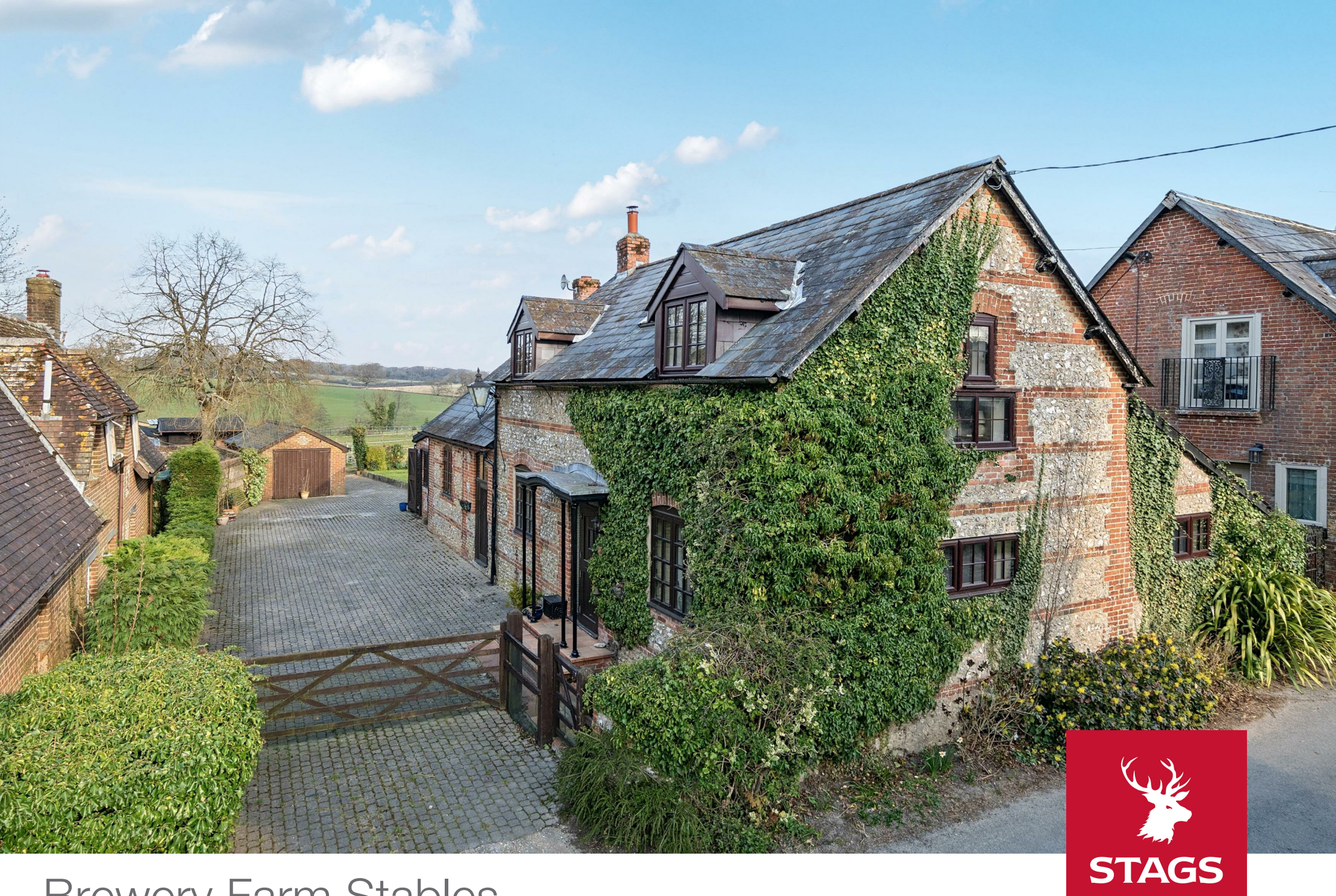
Brewery Farm Stables