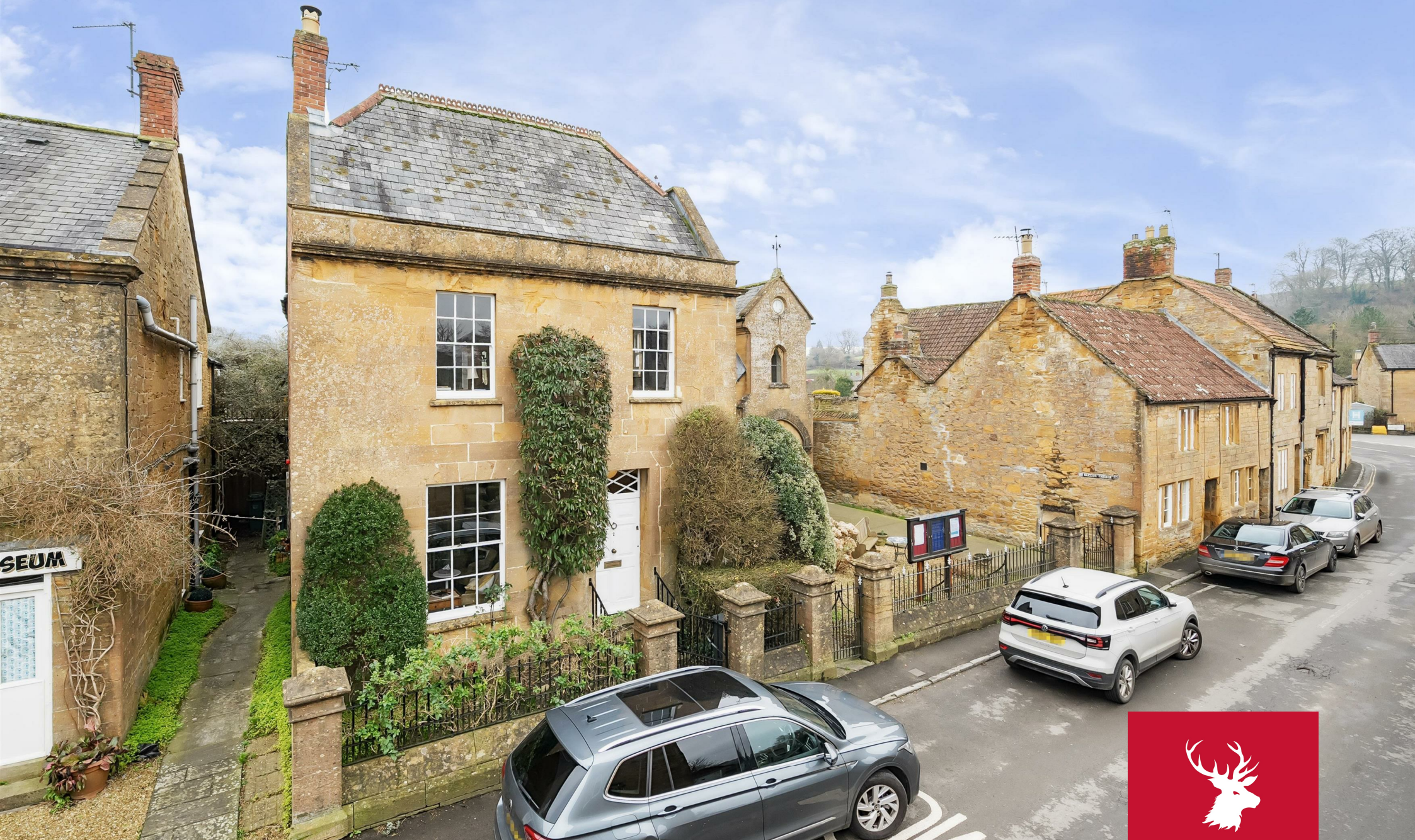
The Old Manse