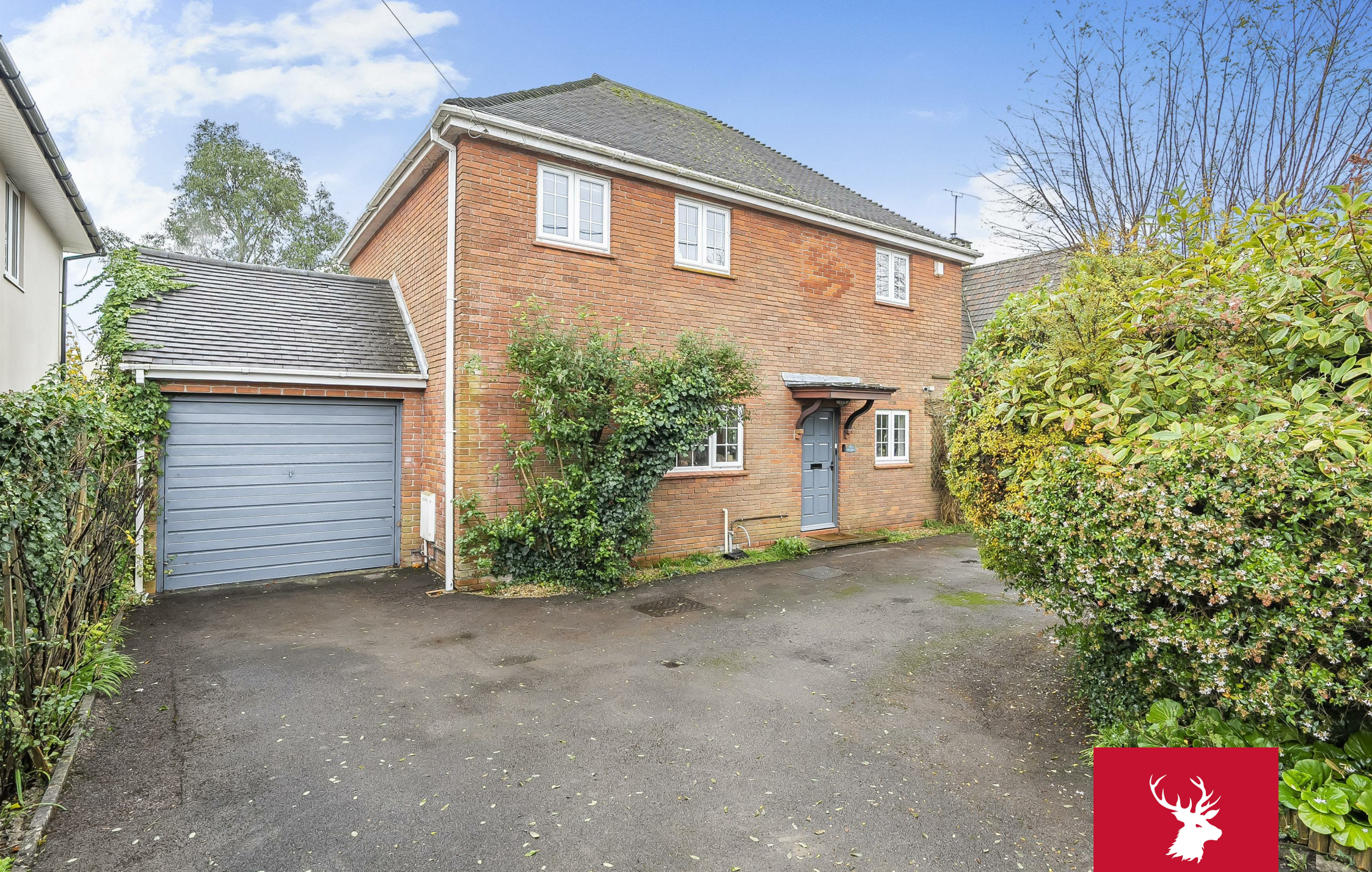
Pax House, 107a, Lenthay Road