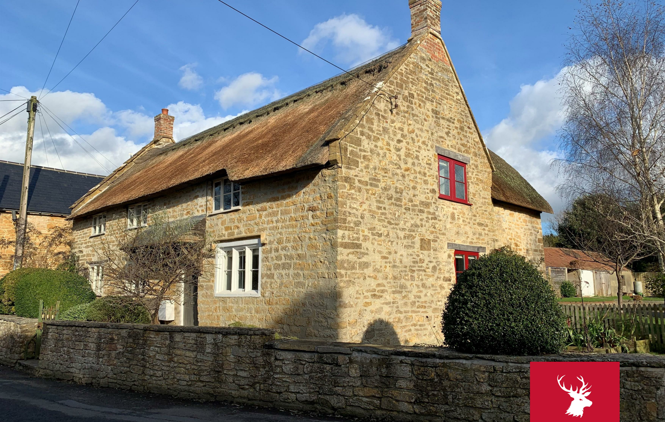
Laurel Cottage, Shiremoor Hill