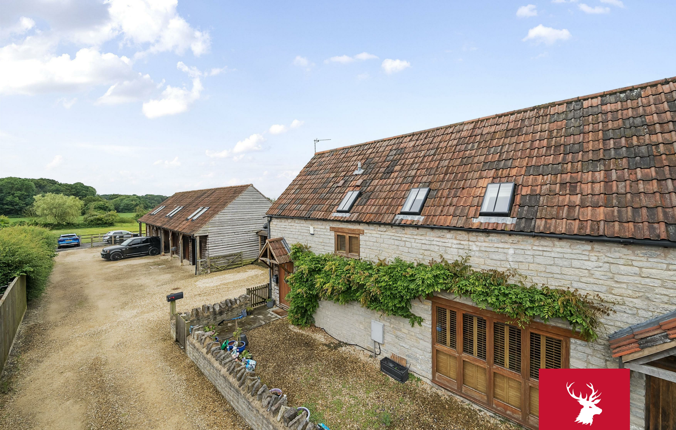
The Old Cider House,