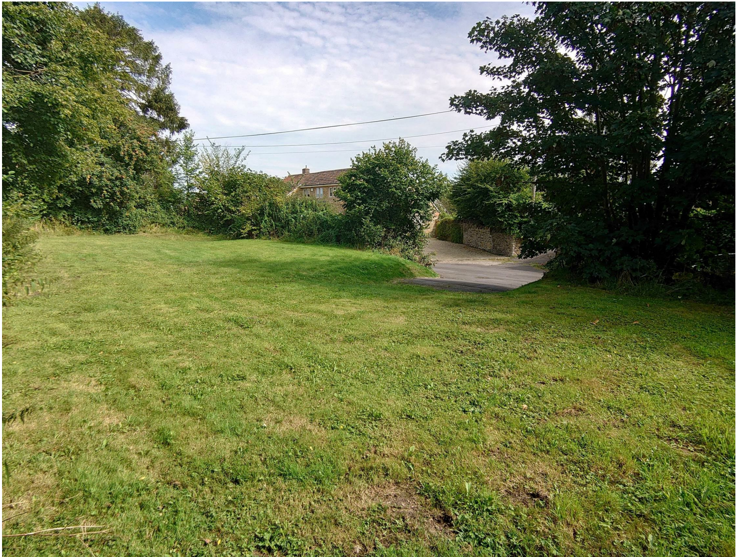
East Coker Building Plot