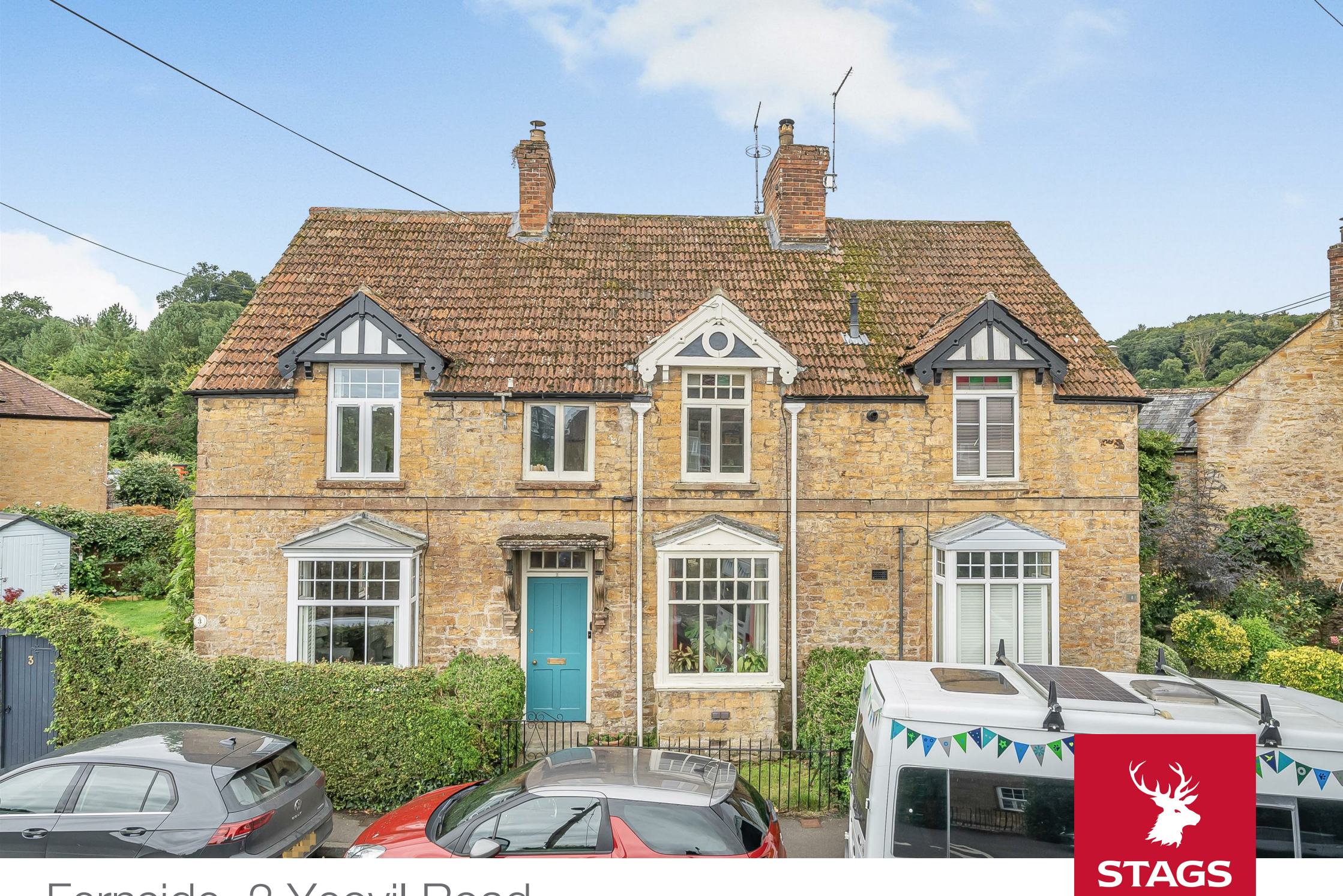
Fernside, 2 Yeovil Road