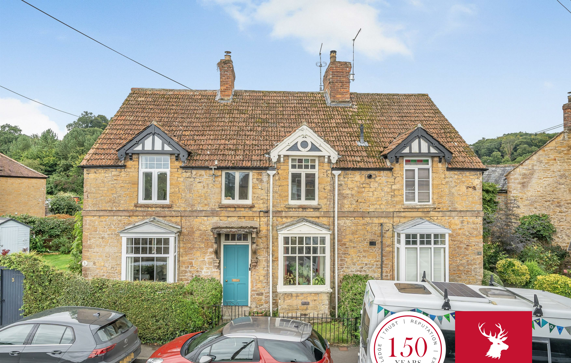
Fernside, 2 Yeovil Road