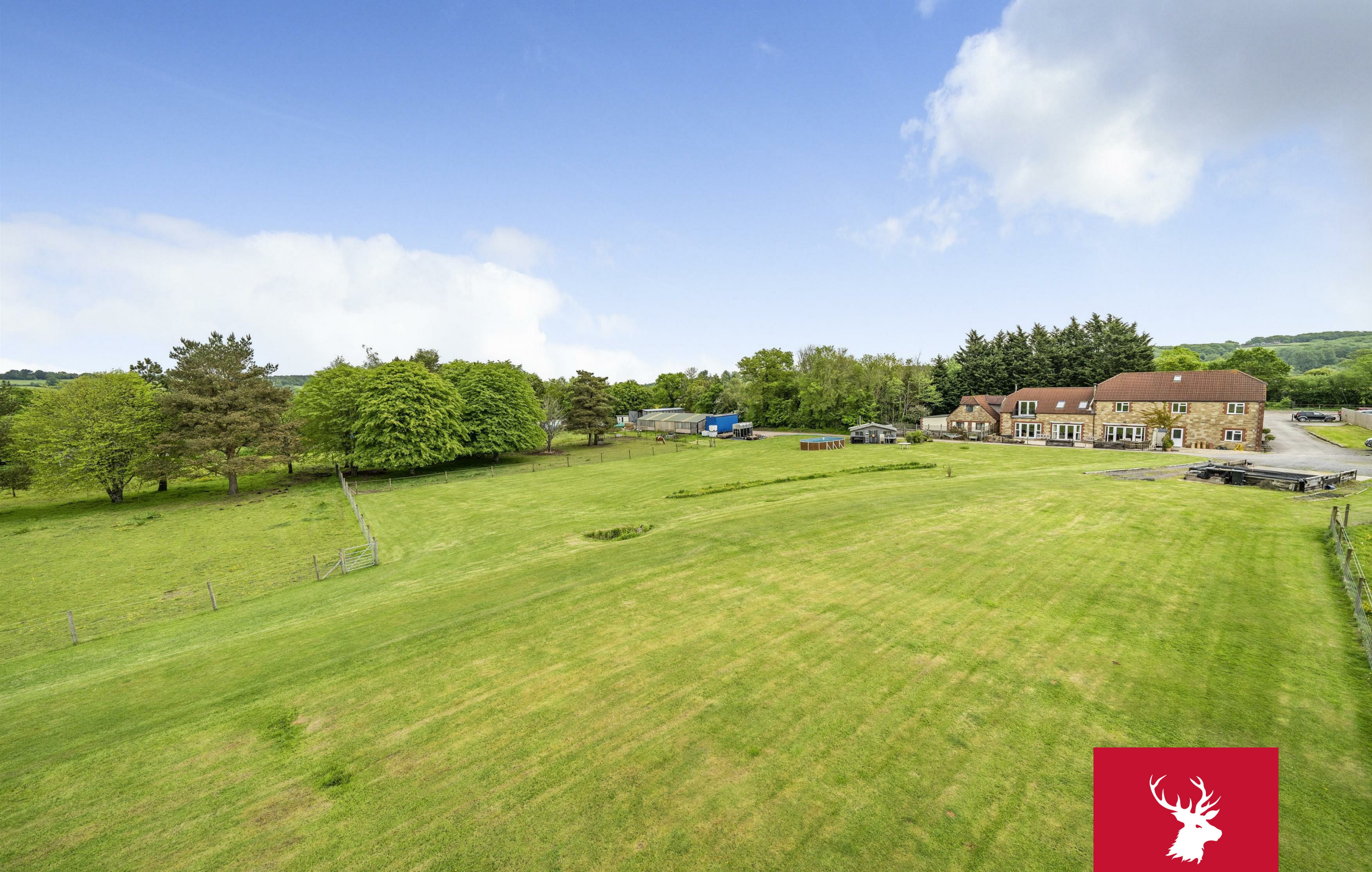
Hickory Lodge and Holly Cottage