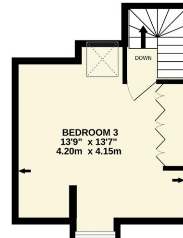
2ND FLOOR 236 sq.ft. (21.9 sq.m.) approx.

IMPORTANT NOTICE If you request a viewing of a property, we the Agent will require certain pieces of personal information from you in order to provide a professional service to both you and our clients. The personal information you provide may be shared with our client, but will not be passed to third parties without your consent. The Agent has not tested any apparatus, equipment, appliance, fixtures, fittings or services and so cannot verify that they are in working order, or fit for the purpose. A Buyer is advised to obtain verification from their solicitor and/or surveyor. References to the tenure/outgoings/charges of a property are based on information supplied by the seller - the Agent has not had sight of the title documents. A Buyer is advised to obtain verification from their solicitor. Items shown in photographs/floor plans are not included unless specifically mentioned within the sale particulars. They may be available by separate negotiation. Buyers must check the availability of any property and make an appointment to view before embarking on a journey to view a property.