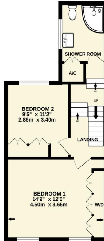
1ST FLOOR 422 sq.ft. (39.2 sq.m.) approx.