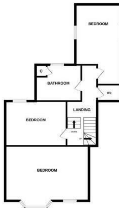
1ST FLOOR 852 sq.ft. (79.2 sq.m.) approx.