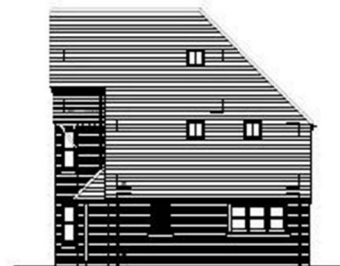
south west elevation - flank