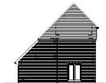
south east elevation - rear