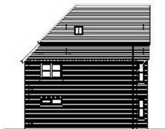
north east elevation - flank