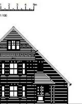
north west elevation - front