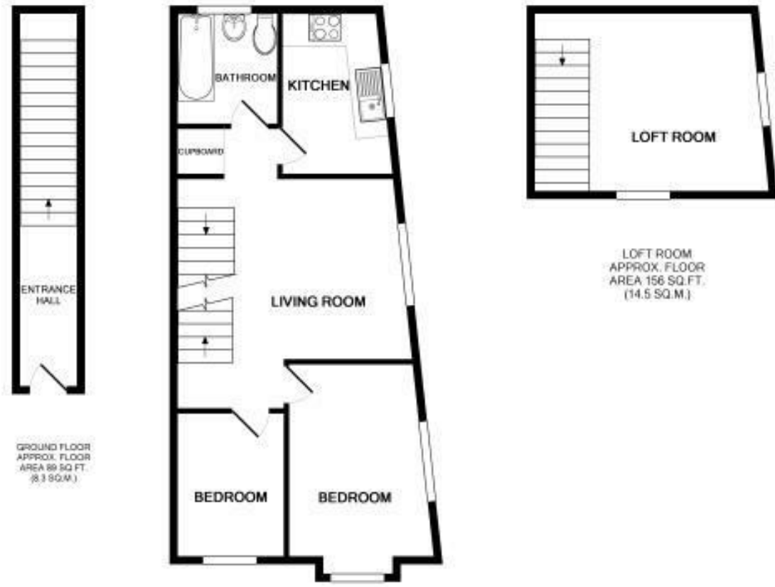
GROUND FLOOR APPROX. FLOOR AREA 89 SQ. FT. (8.3 SQ.M.)