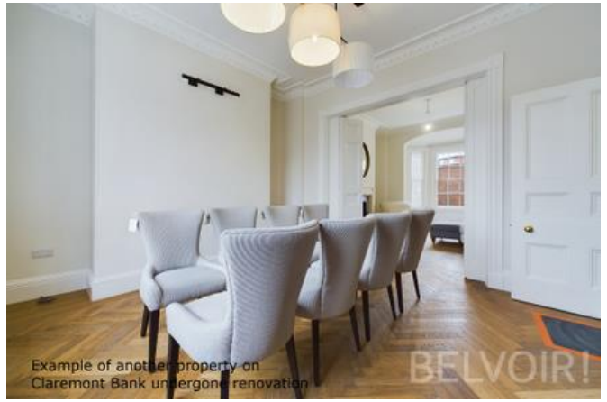
Example of another property on Claremont Bank undergone renovation