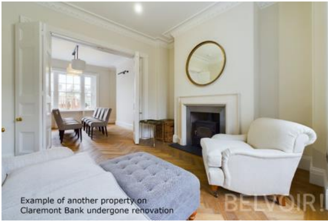
Example of another property on Claremont Bank undergone renovation