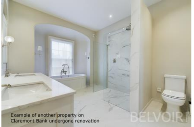
Example of another property on Claremont Bank undergone renovation