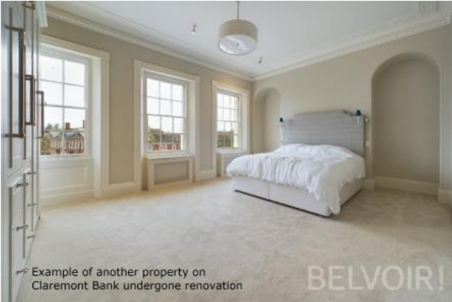
Example of another property on Claremont Bank undergone renovation