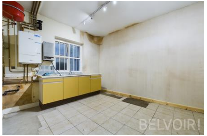
Basement Kitchen 3.56m x 3.19m (11'8" x 10'6")