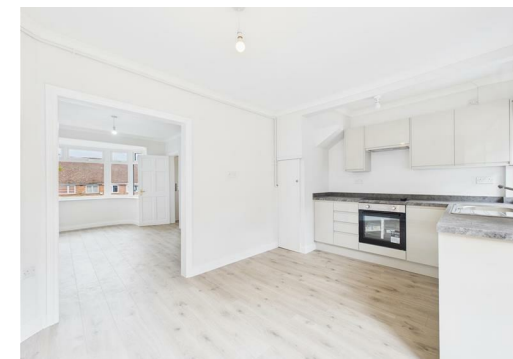
170 Thirlmere Avenue, Tilehurst, Reading, Berkshire, RG30 6XJ £1,700 PCM