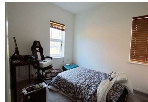
63 Shaftesbury Road, Reading, Reading, Berkshire, RG30 2QJ £1,200 PCM