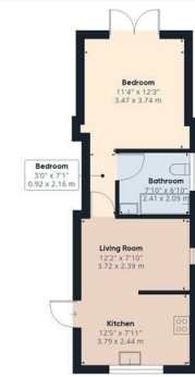
Ground Floor Building 3