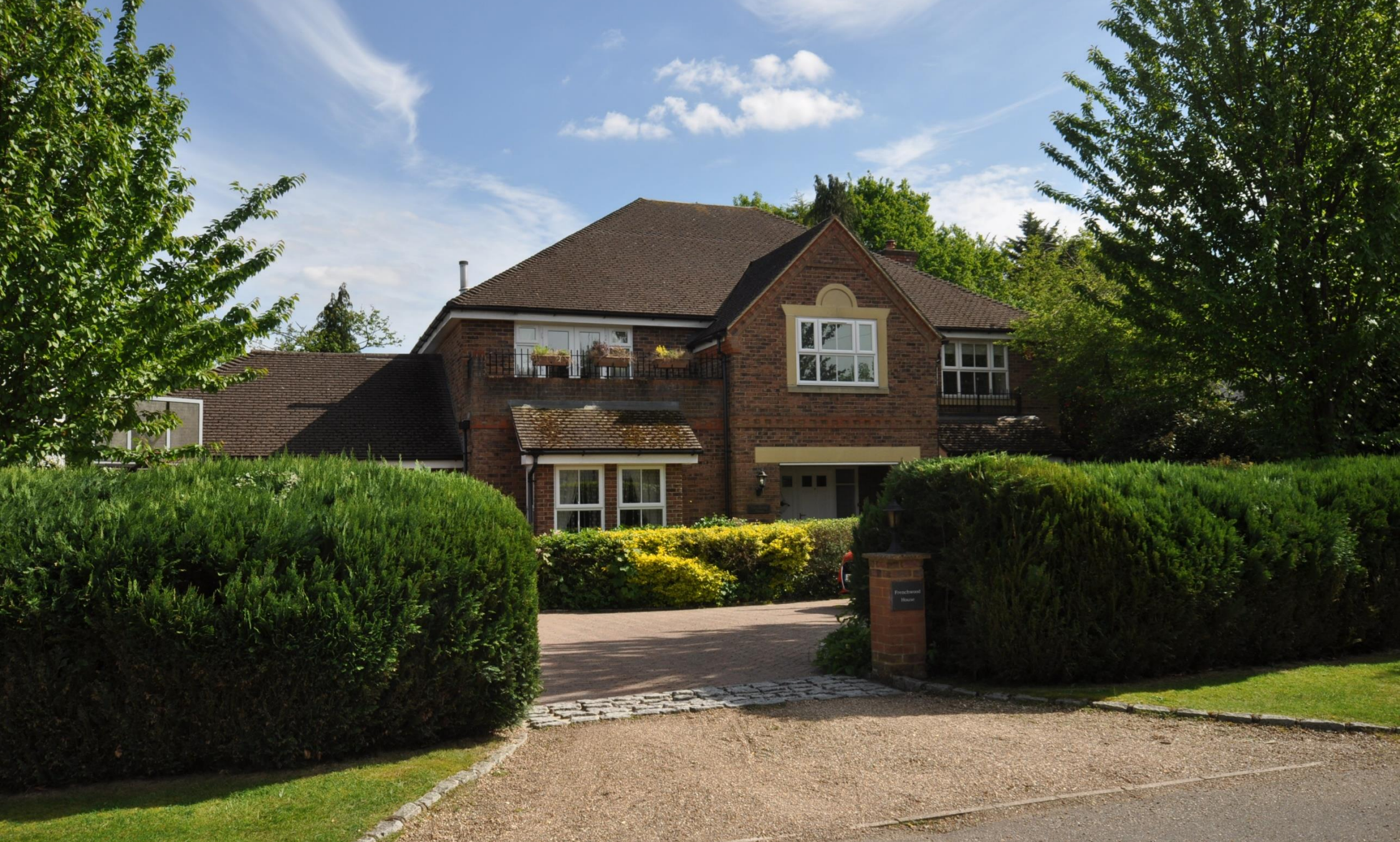
Frenchwood House, Broomfield Park, SL5 0JT