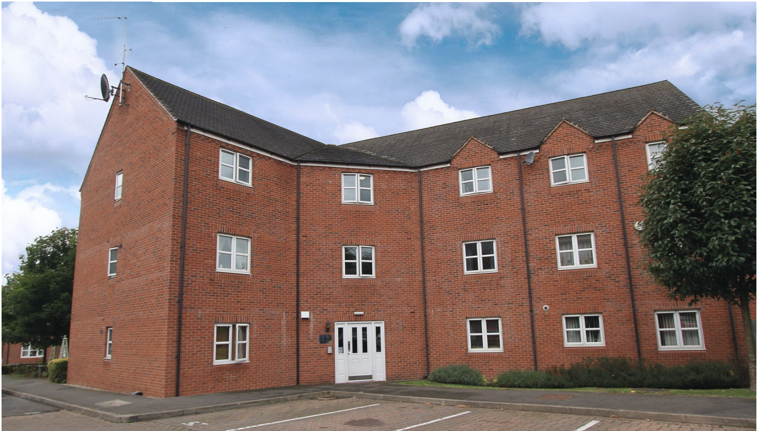
JUNIPER HOUSE, CLARKES COURT, BANBURY, OXON, OX16 2BP

3-4 Horsefair • Banbury • Oxfordshire • OX16 0AA Telephone: 01295 275909 • Email: info@steppingstonesletting.com