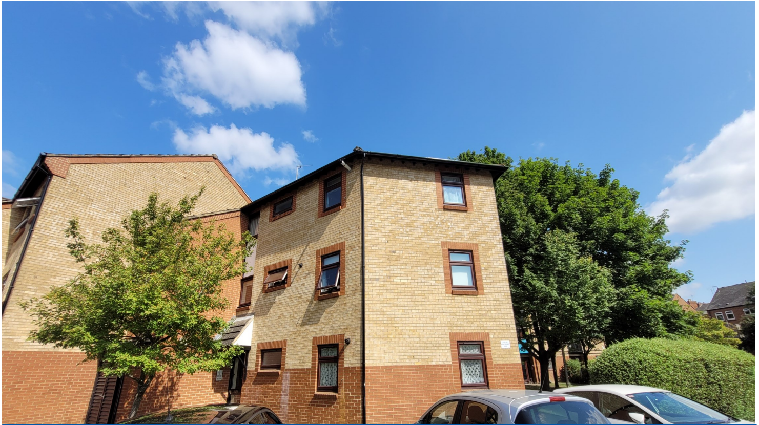
NORTHUMBERLAND COURT, BANBURY, OXON, OX16 4NJ

3-4 Horsefair • Banbury • Oxfordshire • OX16 0AA Telephone: 01295 275909 • Email: info@steppingstonesletting.com