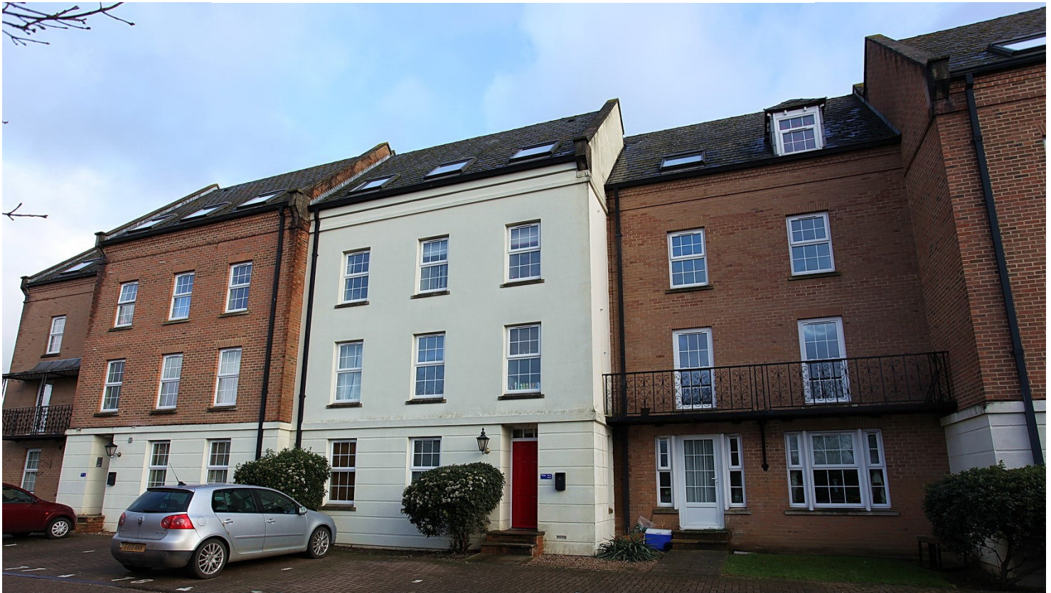
VICTORIA PLACE, BANBURY, OXON, OX16 3NN

3-4 Horsefair • Banbury • Oxfordshire • OX16 0AA Telephone: 01295 275909 • Email: info@steppingstonesletting.com