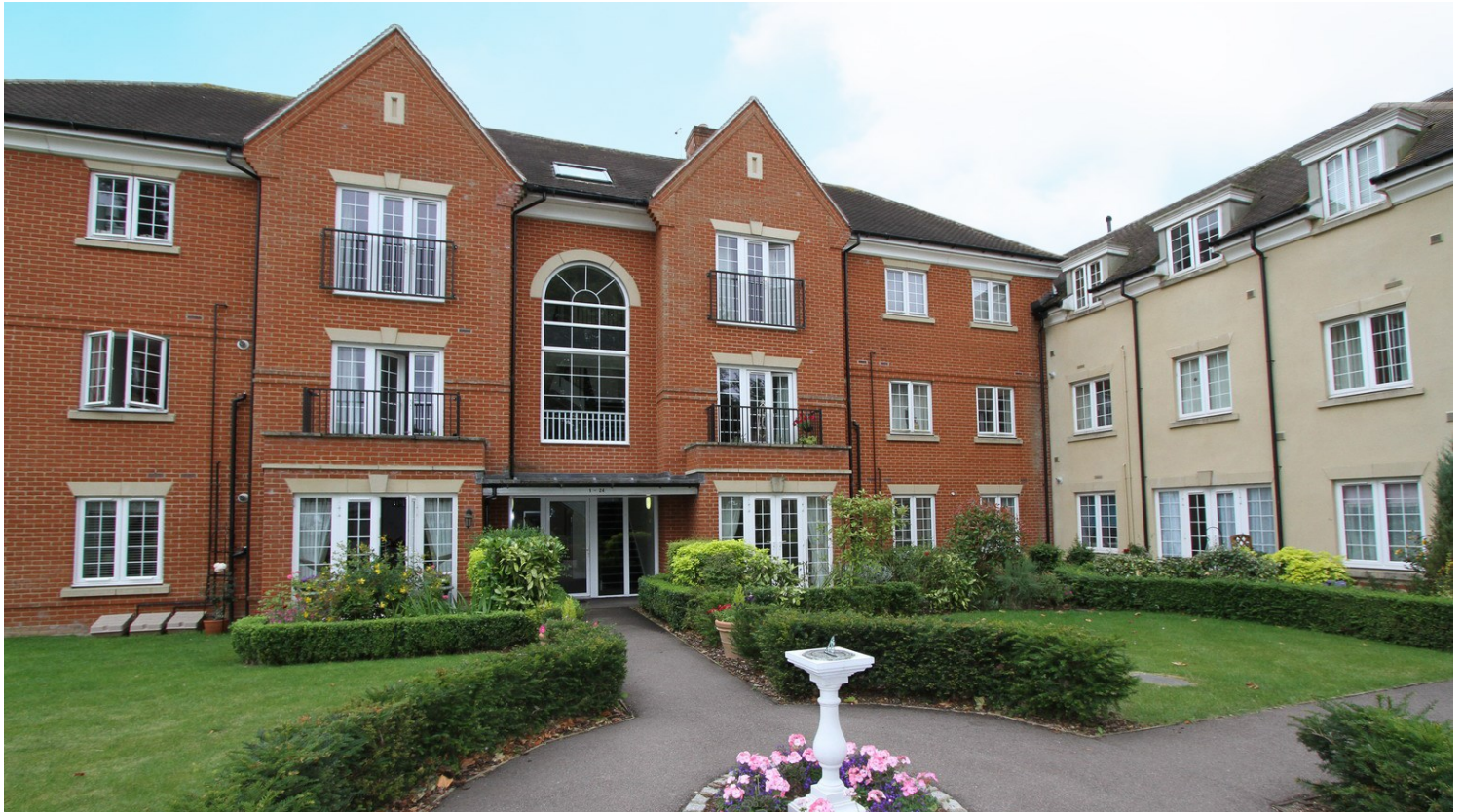
JANET BLUNT HOUSE, GREENHILL, TWYFORD, OX17 3FL

Telephone: 01295 275909 • Email: info@steppingstonesletting.com