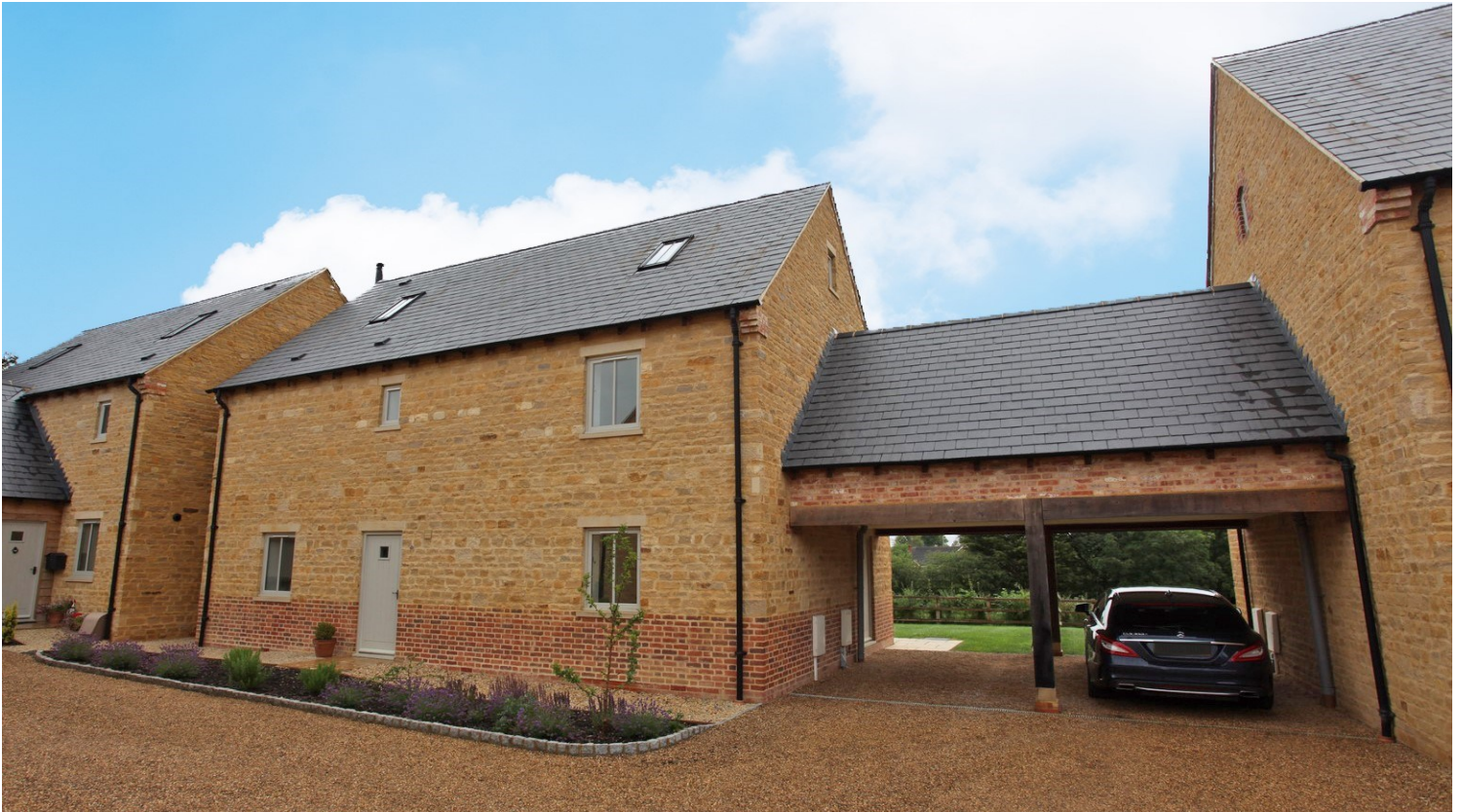
THE ELMS, SILVERSTONE, NORTHANTS, NN12 8WD

3-4 Horsefair • Banbury • Oxfordshire • OX16 0AA Telephone: 01295 275909 • Email: info@steppingstonesletting.com