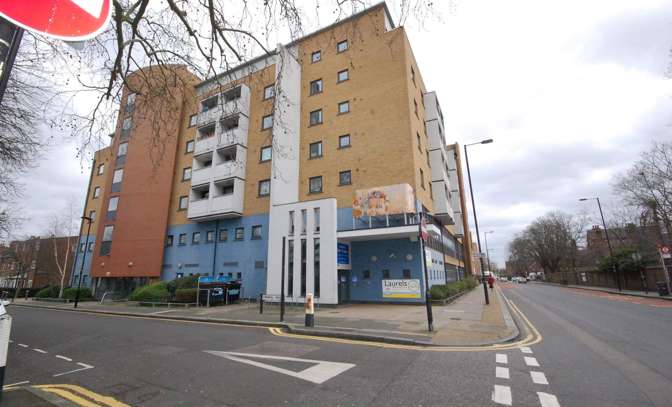
Turners Court Cornwall Road N15 £1200 Per Calendar Month