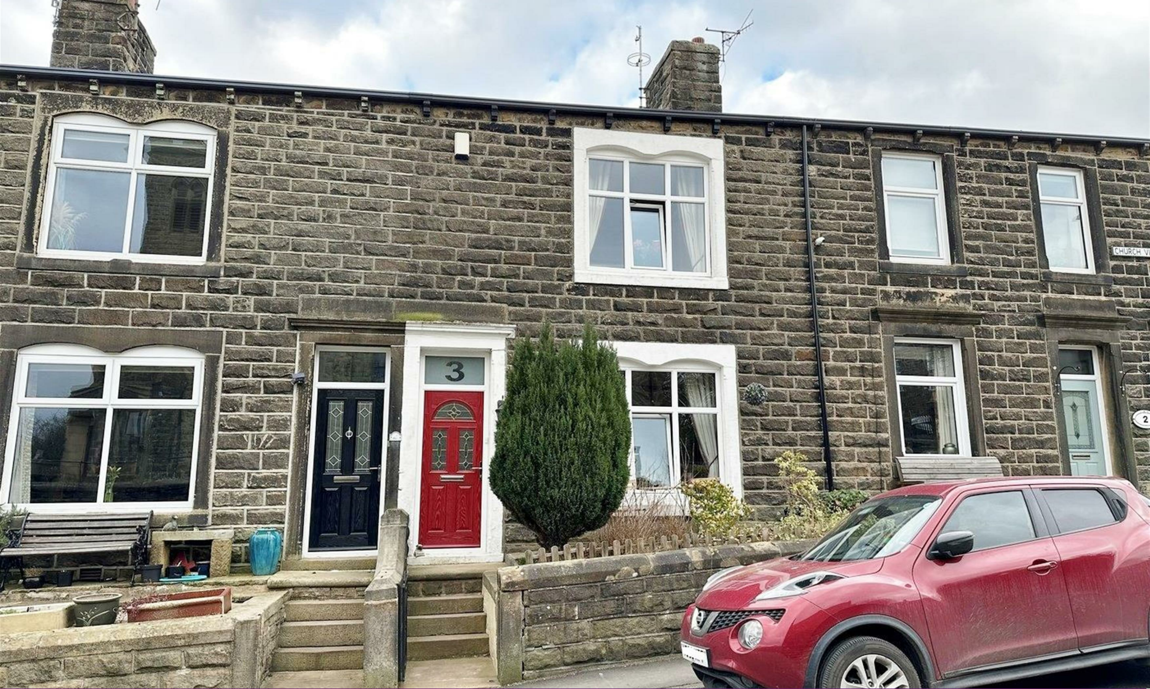
3 Church View, Trawden, BB8 8SA Offers over £169,995