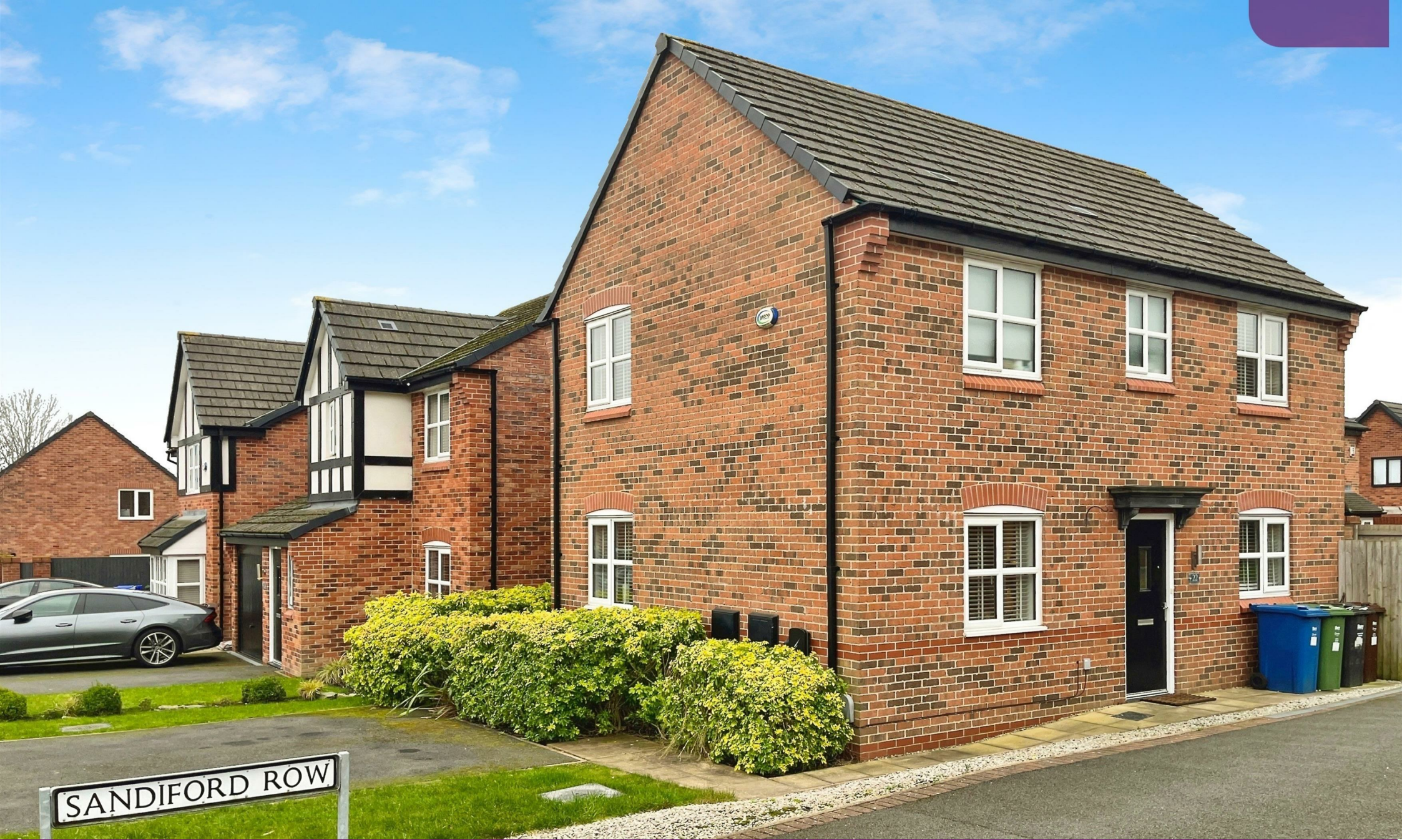
22 Sandiford Row, Radcliffe, Manchester, M26 4LY £329,995