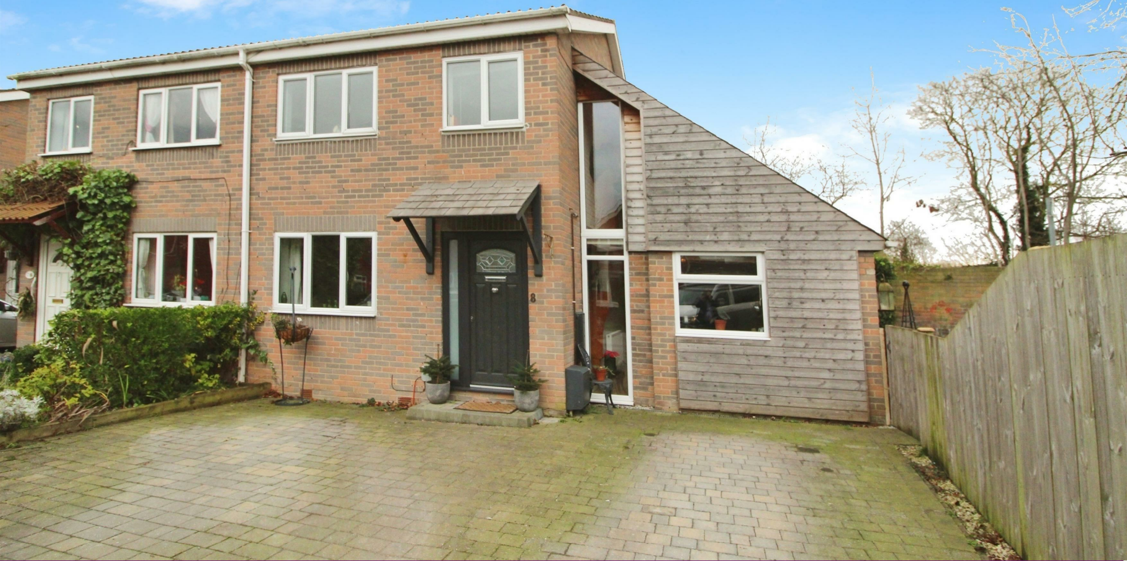
8 Risby Place, Beverley, HU17 8NT £269,950