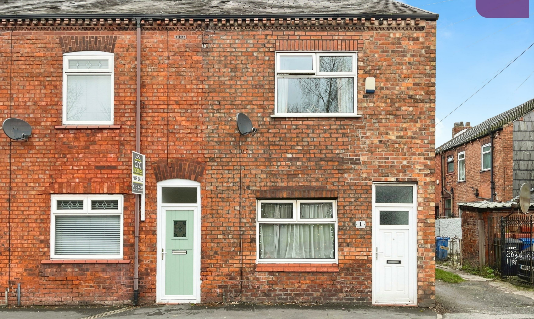
1 Lovers Lane, Atherton, Manchester, M46 0PG Guide price £140,000