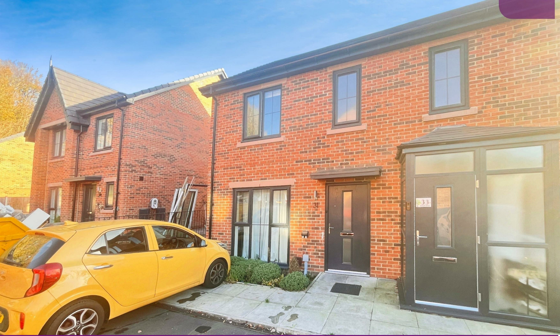
31 Irwell Drive, Salford, M7 3AL £287,000