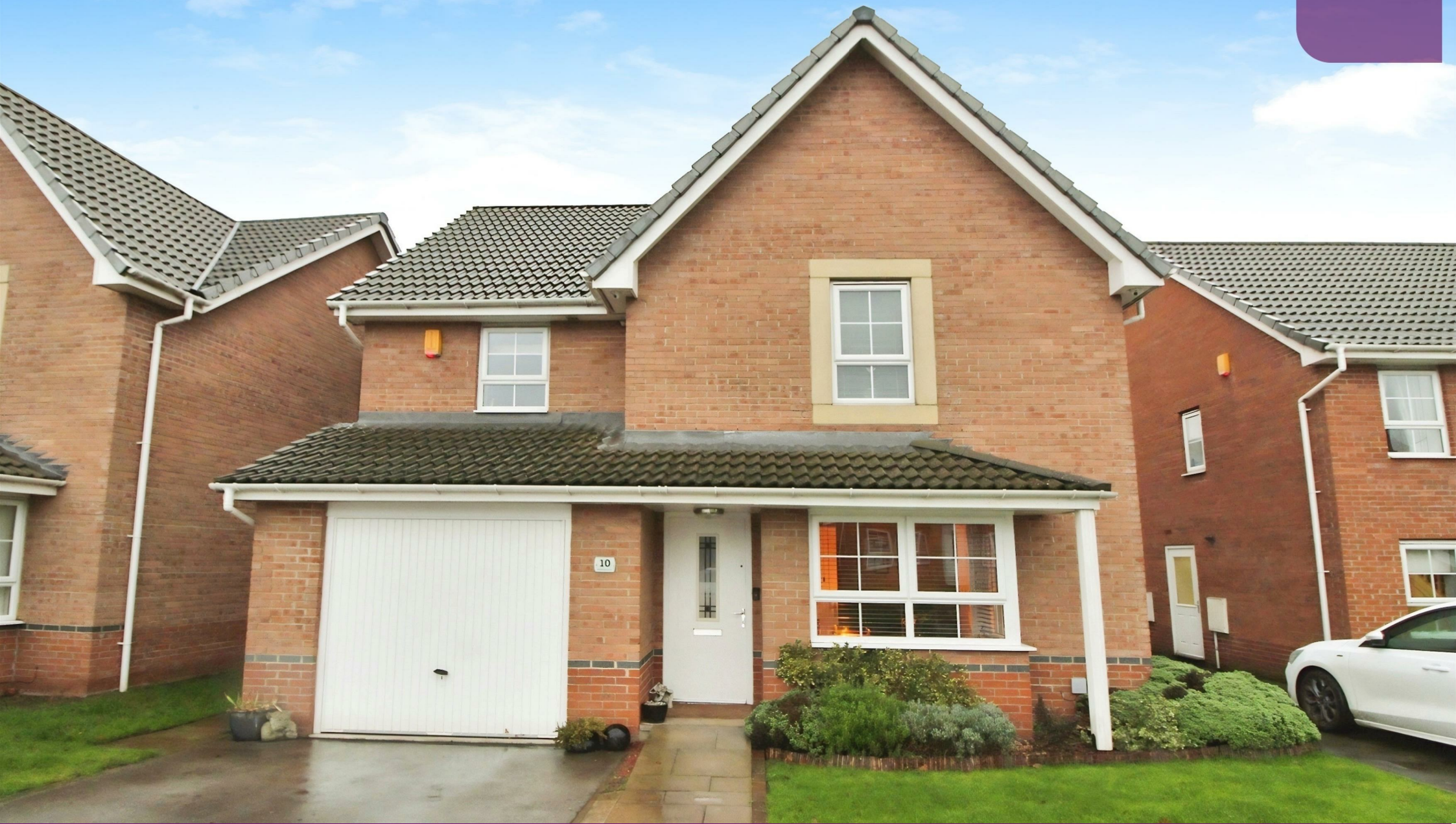
10 Redshank Drive, Scunthorpe, DN16 3FX £279,995