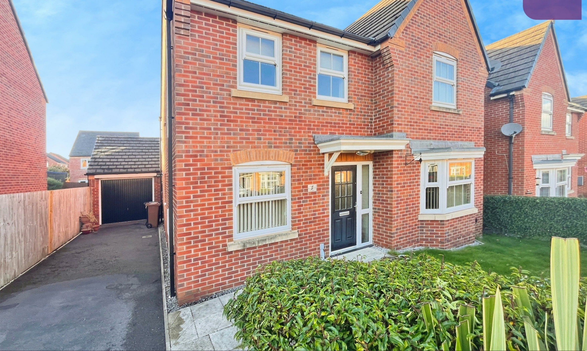
5 Ffordd Boydell, Connah's Quay, Deeside, CH5 4FF £343,000