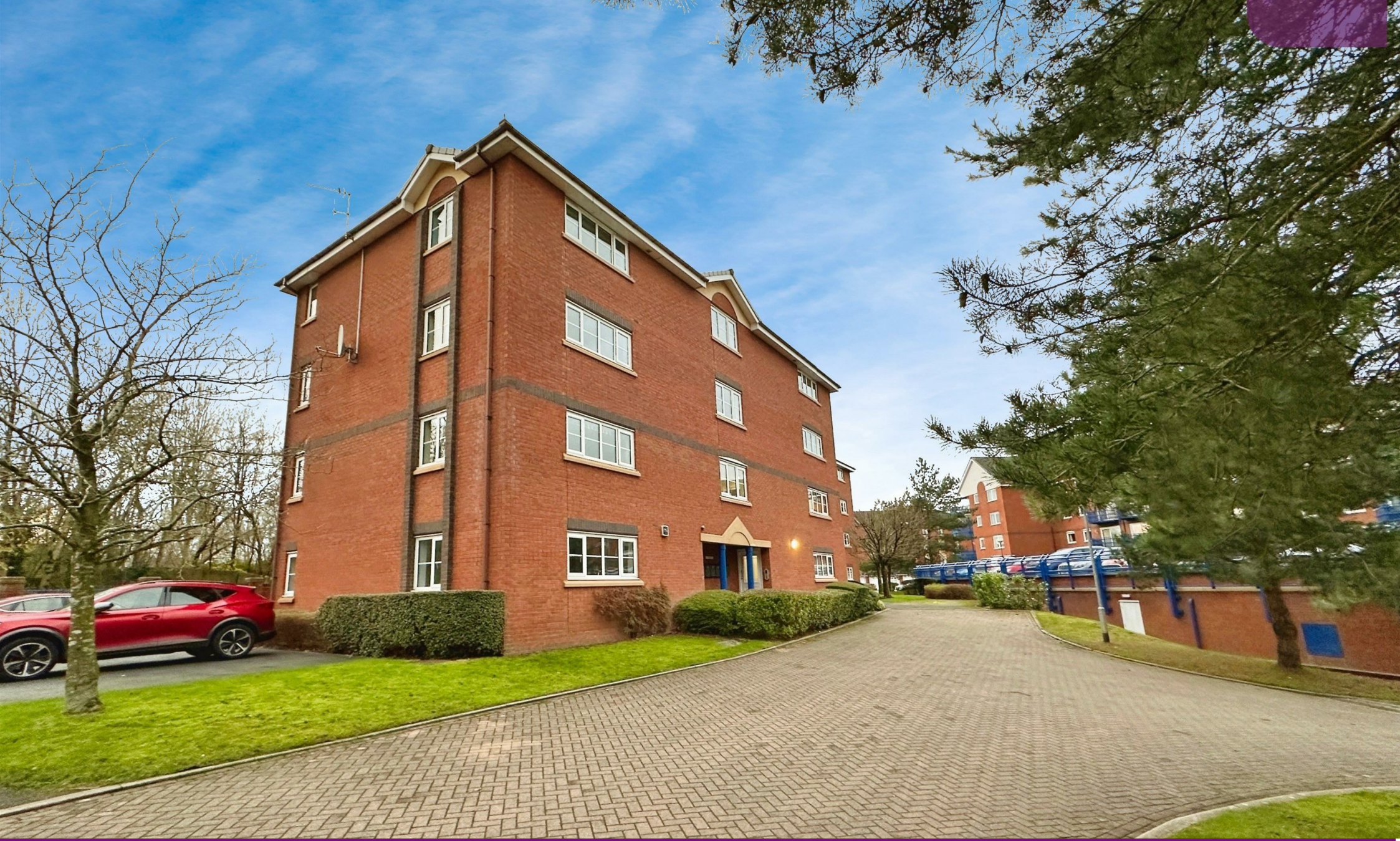
37 Mountbatten Close, Ashton-On-Ribble, Preston, PR2 2YJ £115,000